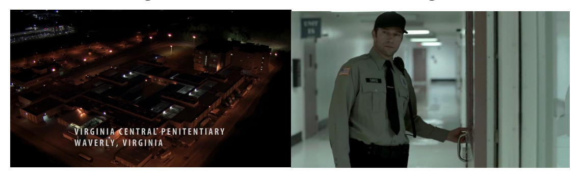
Outer view of Carroll