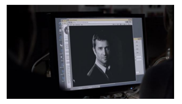
Joe Carroll's portrait

The close-up shots of the computer screen from Image 27 to Image 29 displays this dual persona between Carroll and Poe, when the portrait of Poe slowly starts to become the image of Joe Carroll, or in the last episode when Ryans insults Poe, Carroll loses his composure because he feels as if it was him who was insulted.