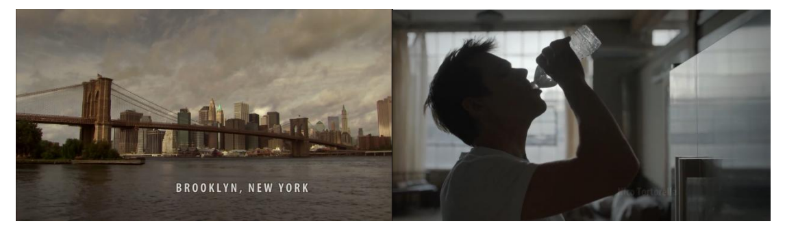
Outer view of New York