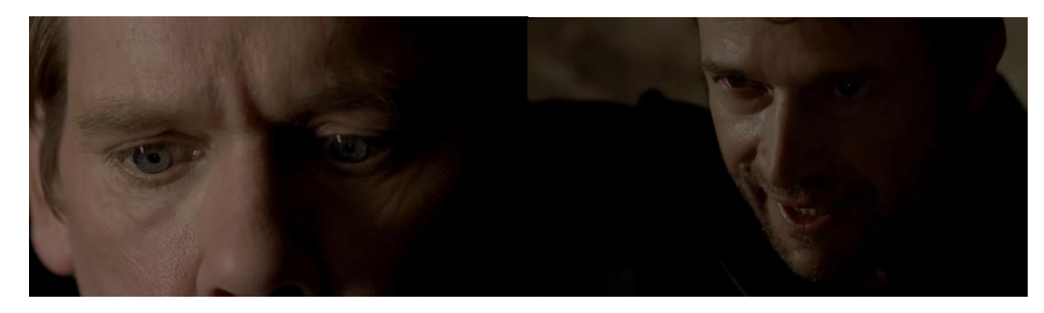
Ryan finds out where Sarah is