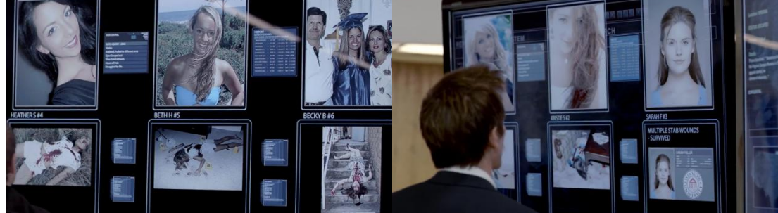
Carroll's female victims