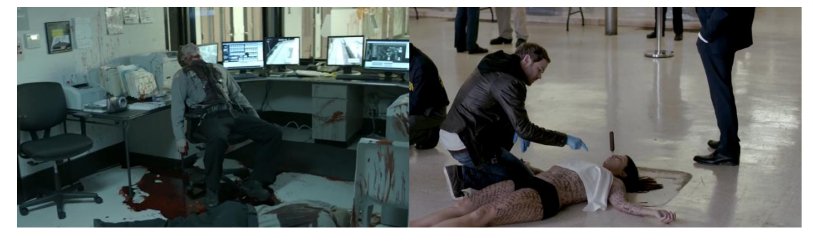
Security team killed by Carroll before his escape