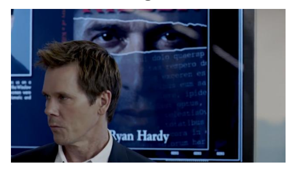
Ryan's book about Carroll

For instance, the extreme close-up shot in Image 10 illustrates the moment when Ryan figures out where Sarah was taken by looking at a picture of Carroll followers on a lighthouse. The close-up shot in Image 11 depicts the moment where Carroll surprises Ryan when he enters the abandoned mansion from Image I. We can observe that in the TV series, we get to enter the character's mind by looking at their eyes provided by these close-ups. Thus, we can see the hatred, the fear, the confusion as their minds break down. This is why the producers emphasize anything relating to sight as shown in the close-up in Image 12, because "the eyes are our identity, windows to our soul" (THE FOLLOWING, 2013, episode 01).